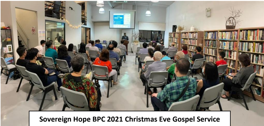
Sovereign Hope BPC 2021 Christmas Eve Gospel Service