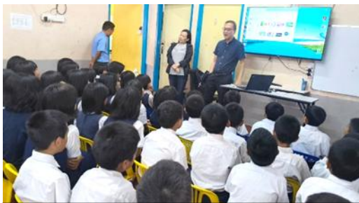
Christian School for children of Myanmar refugees in Cameron Highlands, Malaysia.

opening of the prison to them that are bound; To proclaim the acceptable year of the LORD, and the day of vengeance of our God; to comfort all that mourn.” We are under bounden duty to be considered as a high honour to be heralds for Christ. Let us be zealous and fervent mouthpieces for Christ in our schools, workplace and wherever there is opportunity. The whole gospel is summarised for us in 1 Cor 15:1-