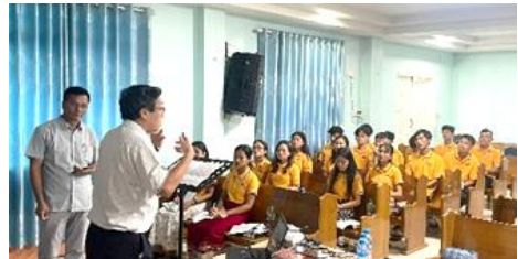
Teaching seminary students in Yangon

The second phase is the confirmation of the saints of the new believers in the face of testings and trials. Satan will not leave a young Christian or growing Church alone. This phrase has the meaning of biblical discipleship of young converts, encouragement in the word of God and training and the equipping of the saints in the knowledge of most holy faith. Paul exhorts us in 2 Tim 2:15 says, " Study