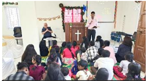
Calvary Reformed Church, Bangalore

The primary goal of the Church together claims the glorious liberty that comes from the pure gospel of Christ alone , to the saving of souls eternally and to worship and exalt the Triune God (Matt 28:18-20). Isa 61:1, 2 says, “ The Spirit of the Lord GOD is upon me; because the LORD hath anointed me to preach good tidings unto the meek; he hath sent me to bind up the brokenhearted, to proclaim liberty to the captives, and the