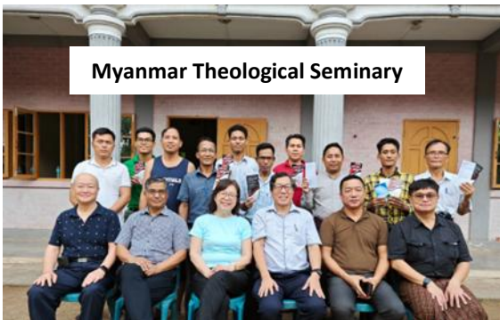
Myanmar Theological Seminary

call, NCBPCI in Bangalore was associated with us and now it has grown to a good size congregation of both adults and children including a Christian kindergarten.