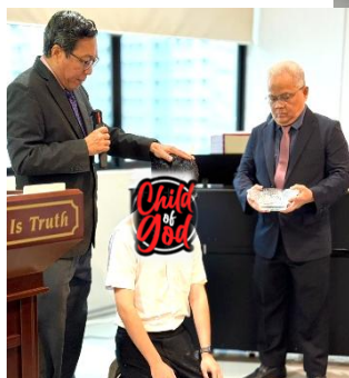
Baptism of a Child of God.