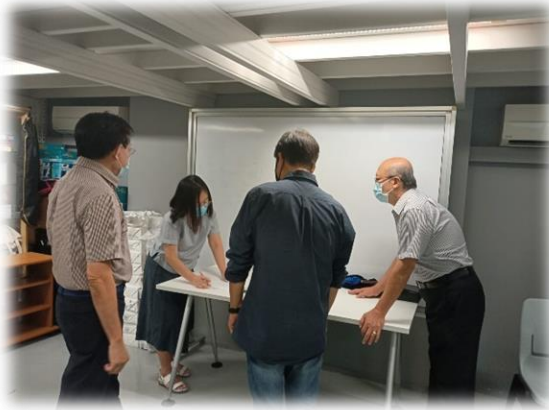
Thank God for many willing hands serving the Lord in various areas of the church.