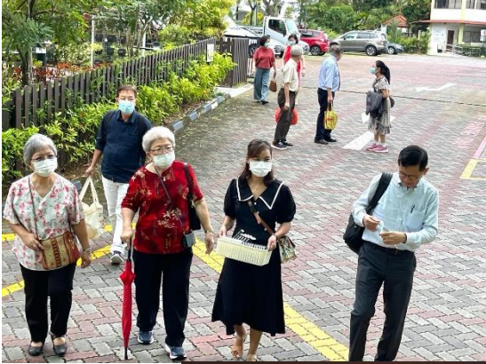
Excited & Ready to minister at All Saints Home (Poh Huat Road)