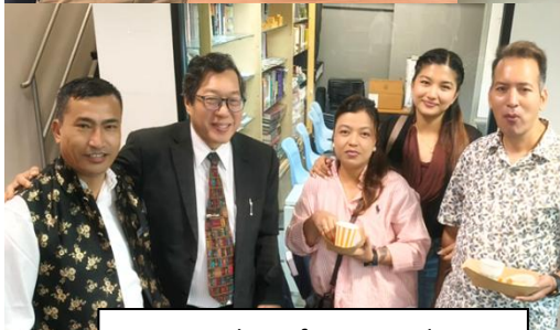
Brethren from Nepal.